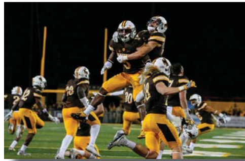
Cowboys Celebrate Win Over Boise State