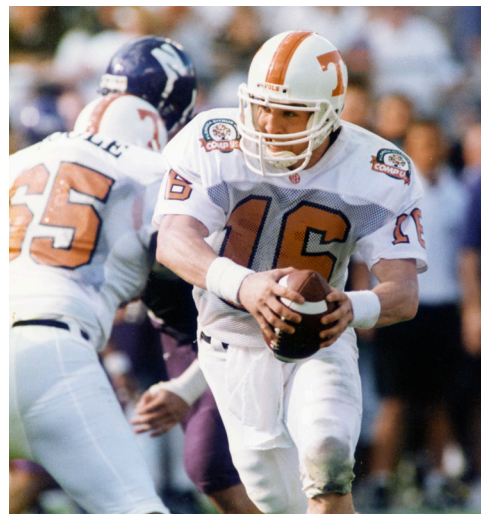
QB Peyton Manning was named MVP of the 1997 Florida Citrus Bowl after leading the Vols to a 48-28 win over Northwestern.

*2020 Gator Bowl win vs. Indiana vacated by NCAA COI