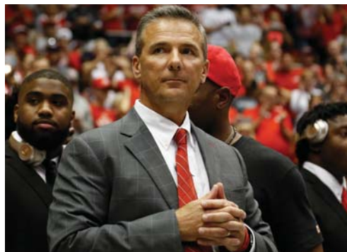
Urban Meyer is in his 16th season as a head coach. His .851 winning percentage (172-30) is highest among all active coaches with at least 10 years experience at a four-year school and third-highest in Division I history.