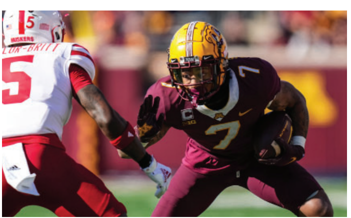
Box Score (Final) The Automated ScoreBook Nebraska vs Minnesota (Oct 16, 2021 at Minneapolis, Minneso)