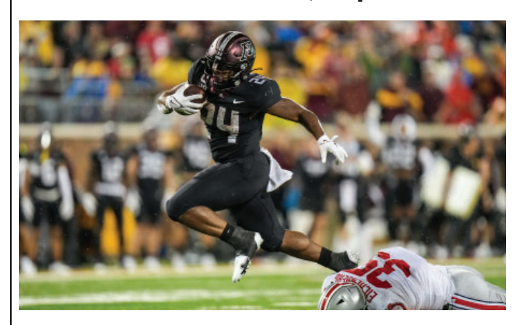
Box Score (Final) The Automated ScoreBook Ohio State vs Minnesota (Sep 02, 2021 at Minneapolis, Minneso)