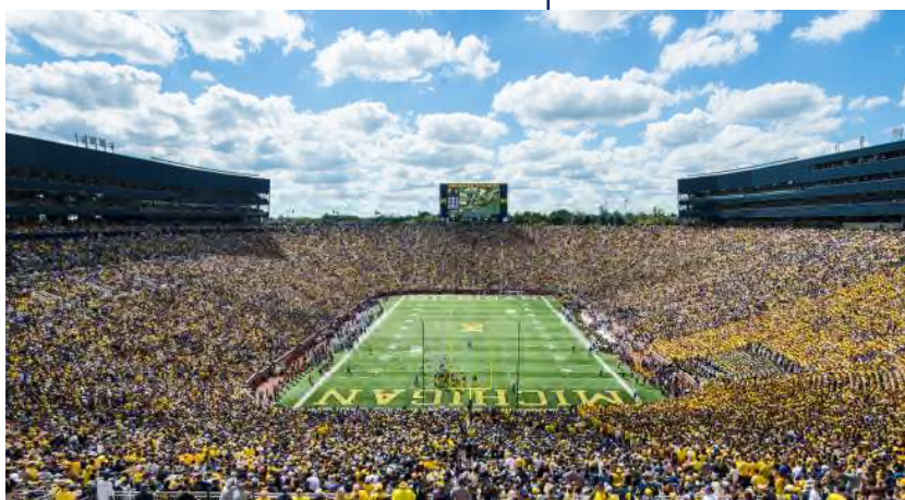
Michigan Stadium (107,601) is the largest venue in college and professional football