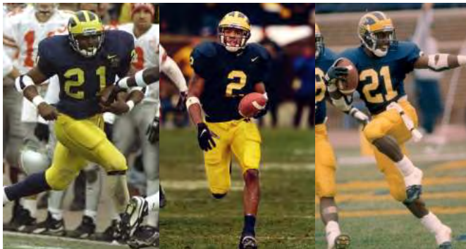
"The Game" between Michigan and Ohio State has been selected as the greatest rivalry in all of sports