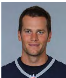
TOM BRADY, QB Tampa Bay Buccaneers 22nd Season