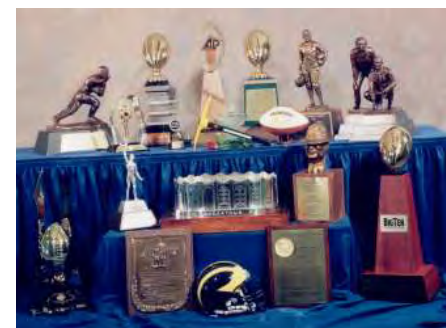
11 National Titles & 42 Big Ten Championships