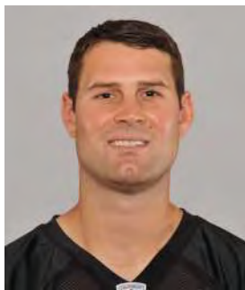
CHAD HENNE, QB Kansas City Chiefs 14th Season