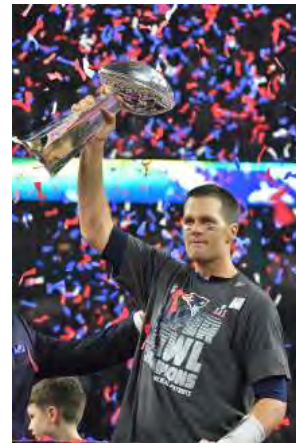
Tom Brady 7-time Super Bowl Champion 5-time Super Bowl MVP