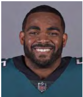
BRANDON GRAHAM, DE Philadelphia Eagles 12th Season