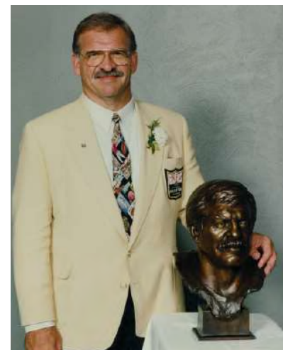
Dan Dierdorf 1996 Pro Football Hall of Fame Inductee; one of 11 Wolverines enshrined