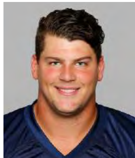
TAYLOR LEWAN, OL Tennessee Titans 8th Season