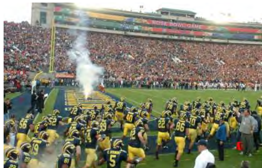
20 Rose Bowl Appearances The most of any Big Ten Conference school and the second-most all-time by any school