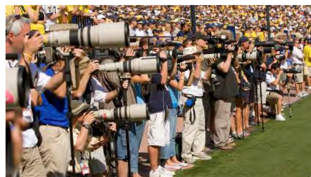
Michigan leads all of college football in television appearances