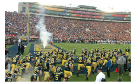
20 Rose Bowl Appearances

The most of any Big Ten Conference school and the second-most all-time by any school