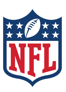
CHAD HENNE, QB Kansas City Chiefs