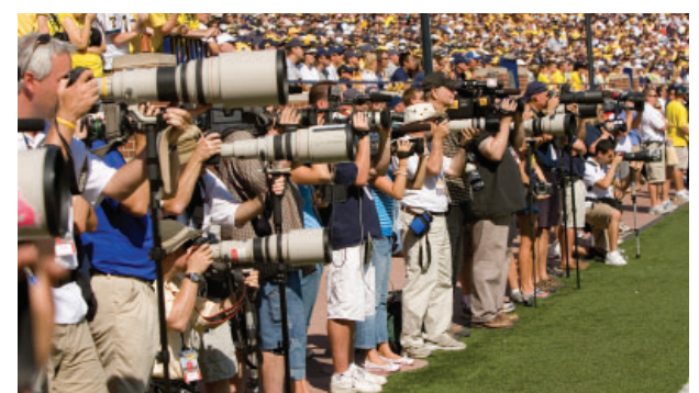
Michigan leads all of college football in television appearances