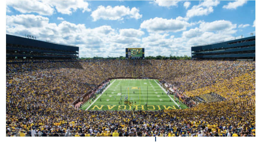
Michigan Stadium (107,601) is the largest venue in college and professional football