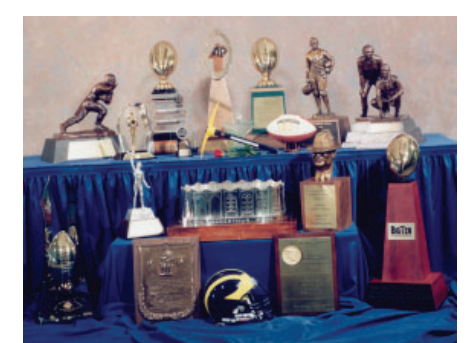
11 National Titles & 42 Big Ten Championships