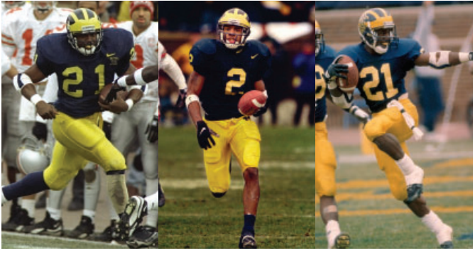
"The Game" between Michigan and Ohio State has been selected as the greatest rivalry in all of sports