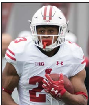
After rushing for 183 yards and a TD at Indiana, Jonathan Taylor picked up his school-record fifth Big Ten Freshman of the Week honor.